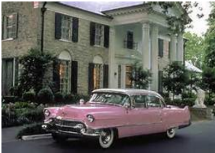
Scouts Rock at Graceland

A complete course guide and registration will be available at www.chickasaw.org in the coming days.